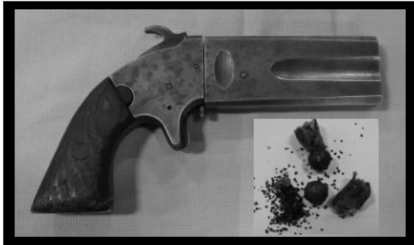
Two powder charges and bullets from "unloaded gun."

ALWAYS run a rod down the barrel and make sure it reaches all the way to the breech!