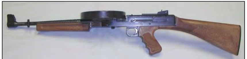
American-180 submachine gun with 176-round drum, left side view.

The American 180 submachine gun was designed by Dick Casull in early 1960s. During the same time he also made about 80 semi-automatic .22 LR rifles, known as Casull Model 290 rifles, with 290. These rifles were finely made and quite expensive.