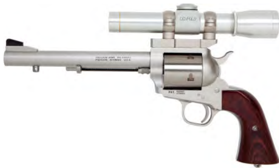
Freedom Arms Model 83 Revolver in .454 Casull

Casull's passion for six-shooters and wildcat cartridges led to the .454 Casull cartridge, first announced in the November 1959 Guns & Ammo magazine. Basically, it was a longer and stronger .45 Colt case, similar to the way .38 Special and longer .357 Magnum. The first commercially available .454 Casull revolver was a five shot revolver made by Freedom Arms in 1983. In 1997 Ruger offered the Super Redhawk in .454 and Taurus followed in 1998 with the Raging Bull and in 2010 with the Taurus Raging Judge Magnum.