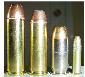
.454 Casull, .44 Magnum, .45 ACP and .22 Long Rifle cartridges

The .454 Casull uses high pressures to push a 250 grain bullet at over 1,900 feet per second. The cartridges were originally loaded with a triplex load of propellants, which gave progressive burning, aided by the rifle primer ignition, resulting in a progressive acceleration of the bullet as it passed up the barrel.