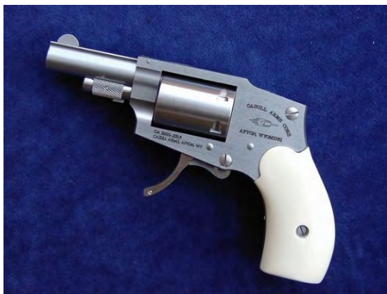
Above— NAA "Earl" .22 percussion revolver with .22 LR conversion cylinder.