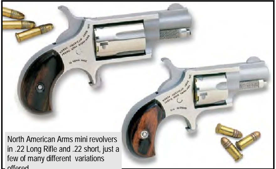
North American Arms mini revolvers in .22 Long Rifle and .22 short, just a few of many different variations offered.

In the 1990s, Casull sold his share of Freedom Arms, and started up "Casull Arms" in Afton, Wyoming, to pursue new ideas. Around 2000, he made a one time limited run of double action only, folding trigger mini revolvers sold as the "Casull Arms CA 2000." They came packaged in a cutout book The Casull Arms Story . The first 20 or so pages are story, and the last 3/4 of the book is cutout for the gun.